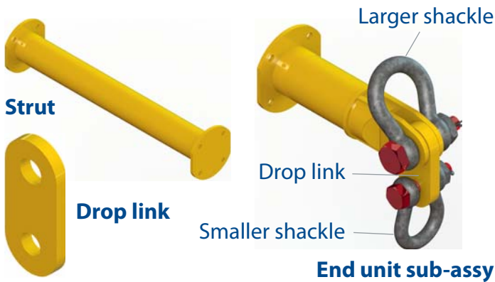
Table 1 – Component List